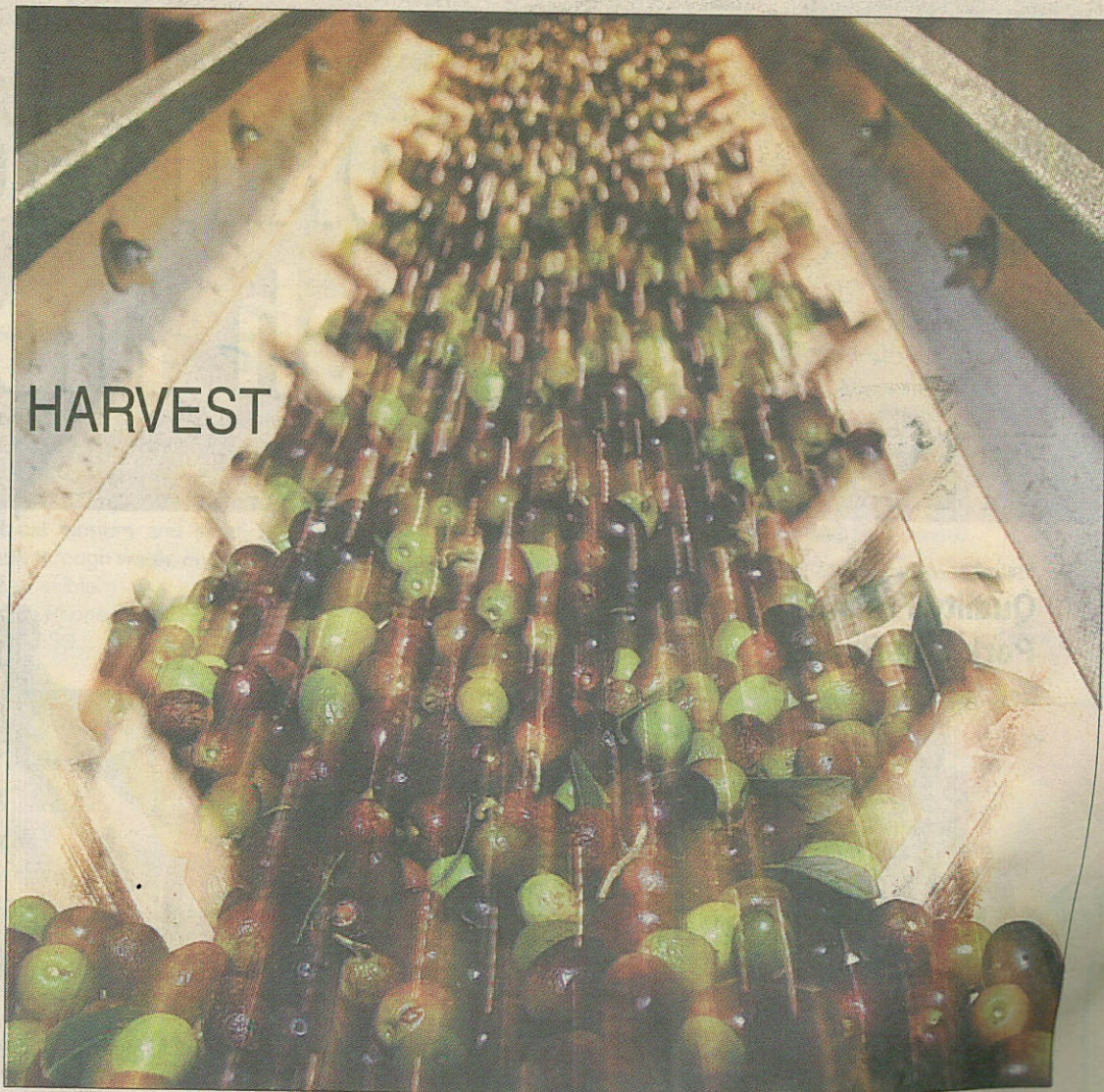
ABOVE LEFT: Handpicking at Juno Olives – Greytown.